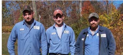
City workers spent three days preparing the site. Volunteers planted the site in one day. The project was funded by Virginia Environmental Endowment and Dominion Foundation.