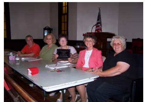
Pocahontas Town Council, above, accepted the outstanding town award in the 2007 KSVB awards contest.