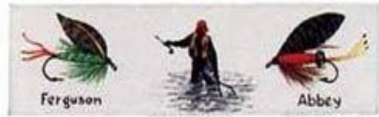
Drawing by: Geof Markovich