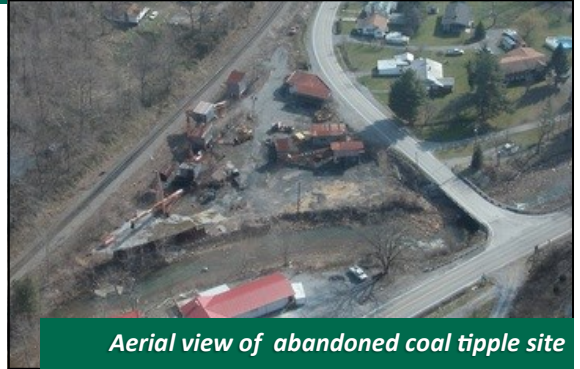
Aerial view of abandoned coal tipple site

Mine-scarred lands have become a persistent problem in many communities due to the economic and environmental challenges of cleaning up and reusing mine-scarred lands. Stone Creek Tipple Site in Pennington, VA was selected as one of the six National Brownfields Mine Scarred Land Demonstration Projects across the US.